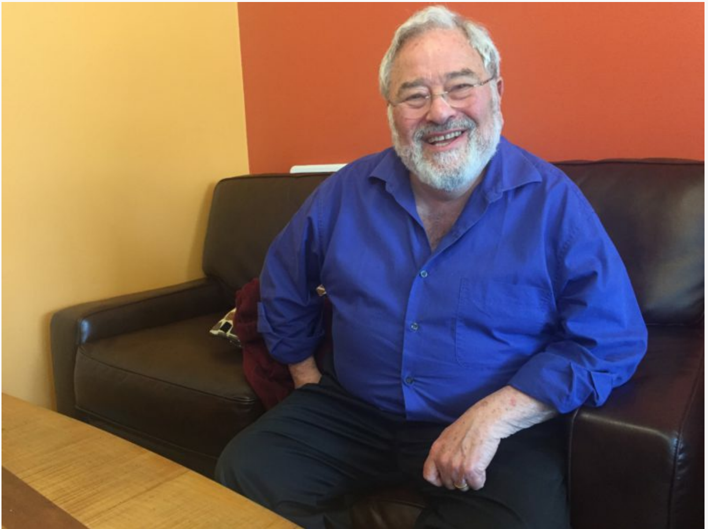
George Lakoff.

George Lakoff , retired UC Berkeley professor and author of Don't Think of an Elephant , is one of a very few people in Berkeley who does not underestimate Donald Trump.